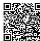
Current Collections Policy QR-code

Last summer, the Board approved a new collections policy. That policy is available on bphoa.info . You can view it by scanning the QR-code to the right: